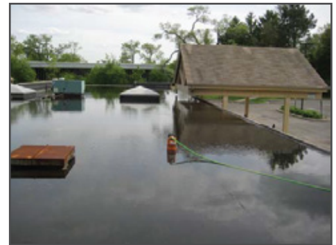
Flooded roof tops