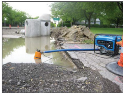
Standing water on road construction

Screws for Leveling or Height Adjustment - Provided for Optional Use