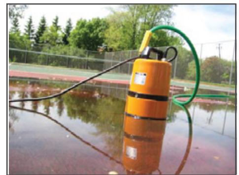
Standing water at sports facilities