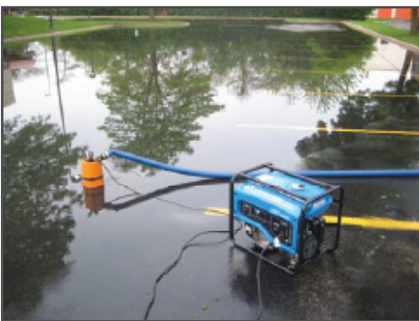
Flooded parking lots