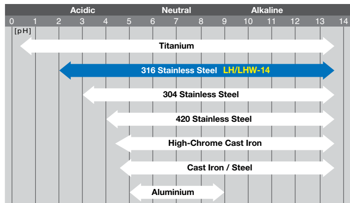
The above data is a rough indication for sulfuric acid (H2SO4) and sodium hydroxide (NaOH). Metals are affected by the type of acid/alkali, seal material, painting and abrasive environment.